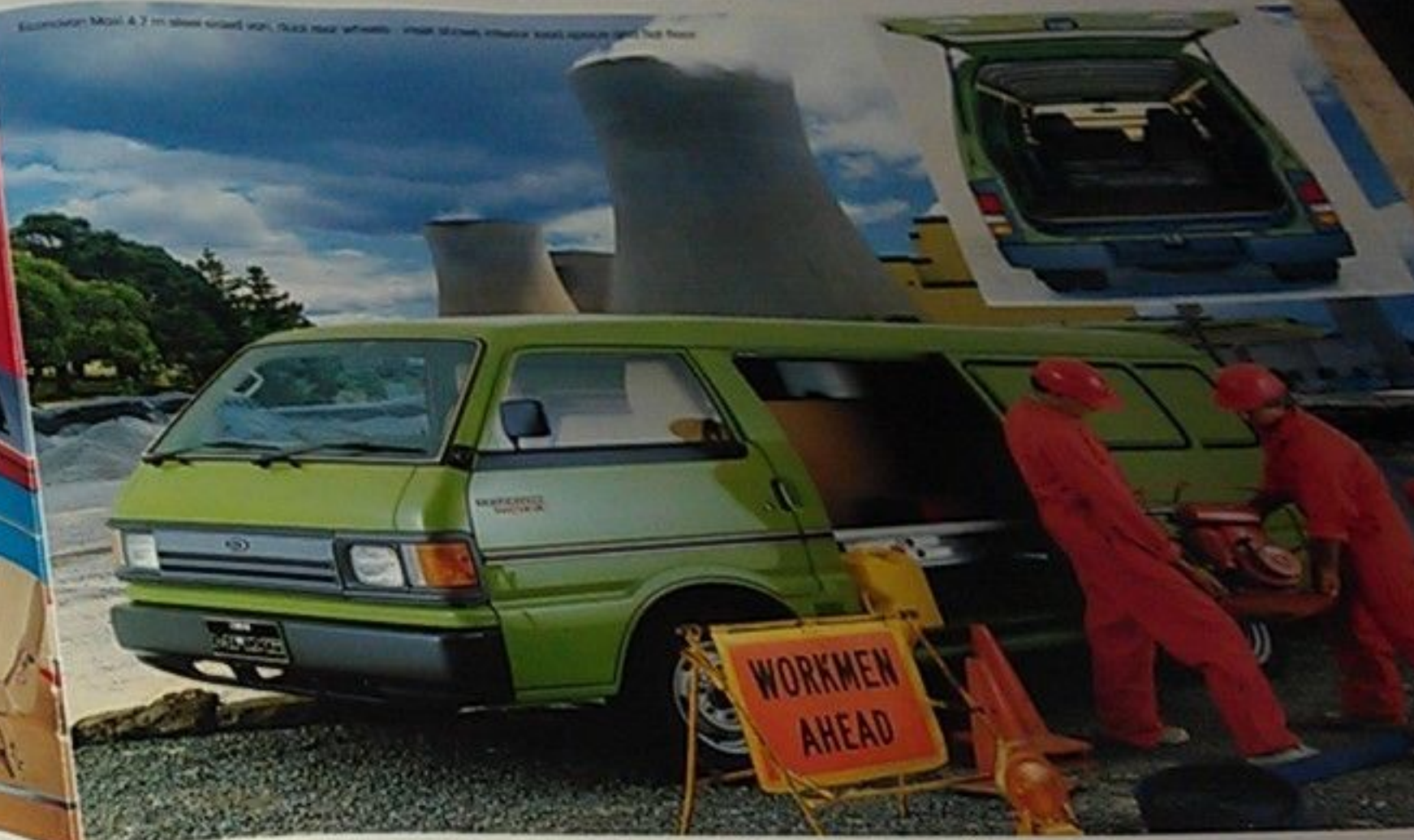
Econovan Maxi 4.7 m steel-sided van, dual rear wheels — steel-sided interior steel-sided van

4.7 metres long. High roof, steel-sided vans. Single rear wheels, 2.0 litre petrol engine, five-speed manual transmission. Dual rear wheels, 2.0 litre petrol or 2.2 litre diesel engine, five-speed manual transmission.